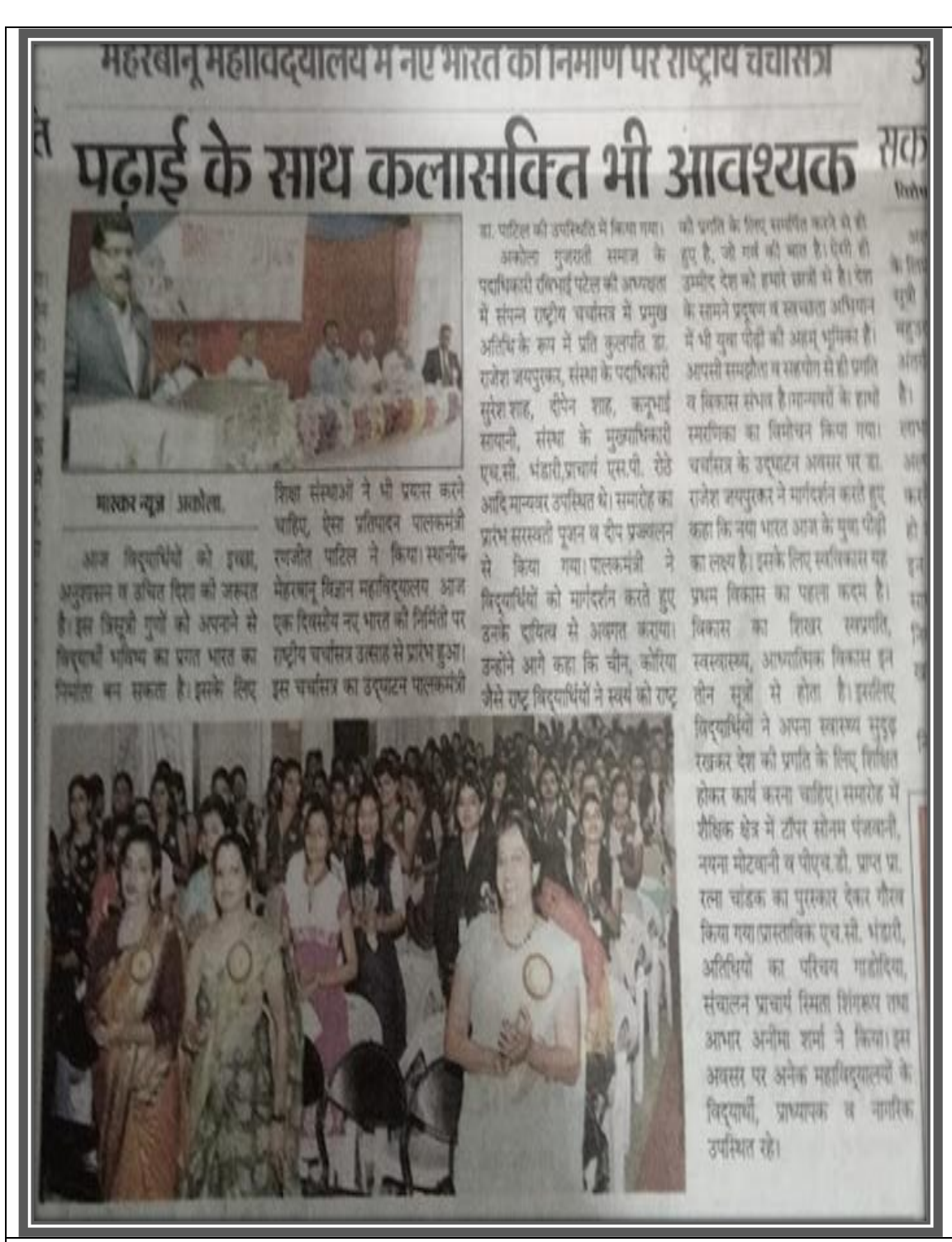
National Conference in News Paper edition