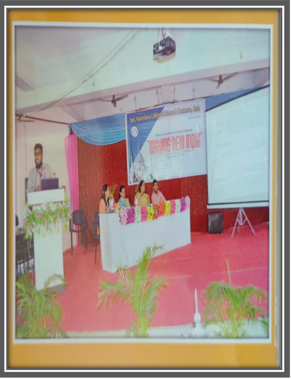
Students from Students of instution taking active participation in the Conference