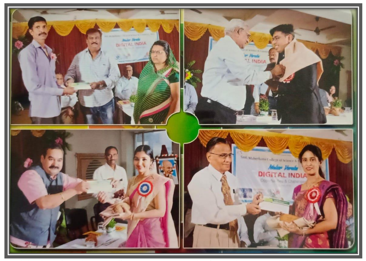
Felicitation of merit holder Students and Faculties for their outstanding achievements with Cash prize on the hands of dignitaries.