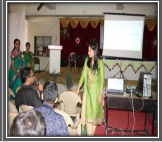
Digital India – Opportunities and Challenges: Inaugural in hands of the dignitaries