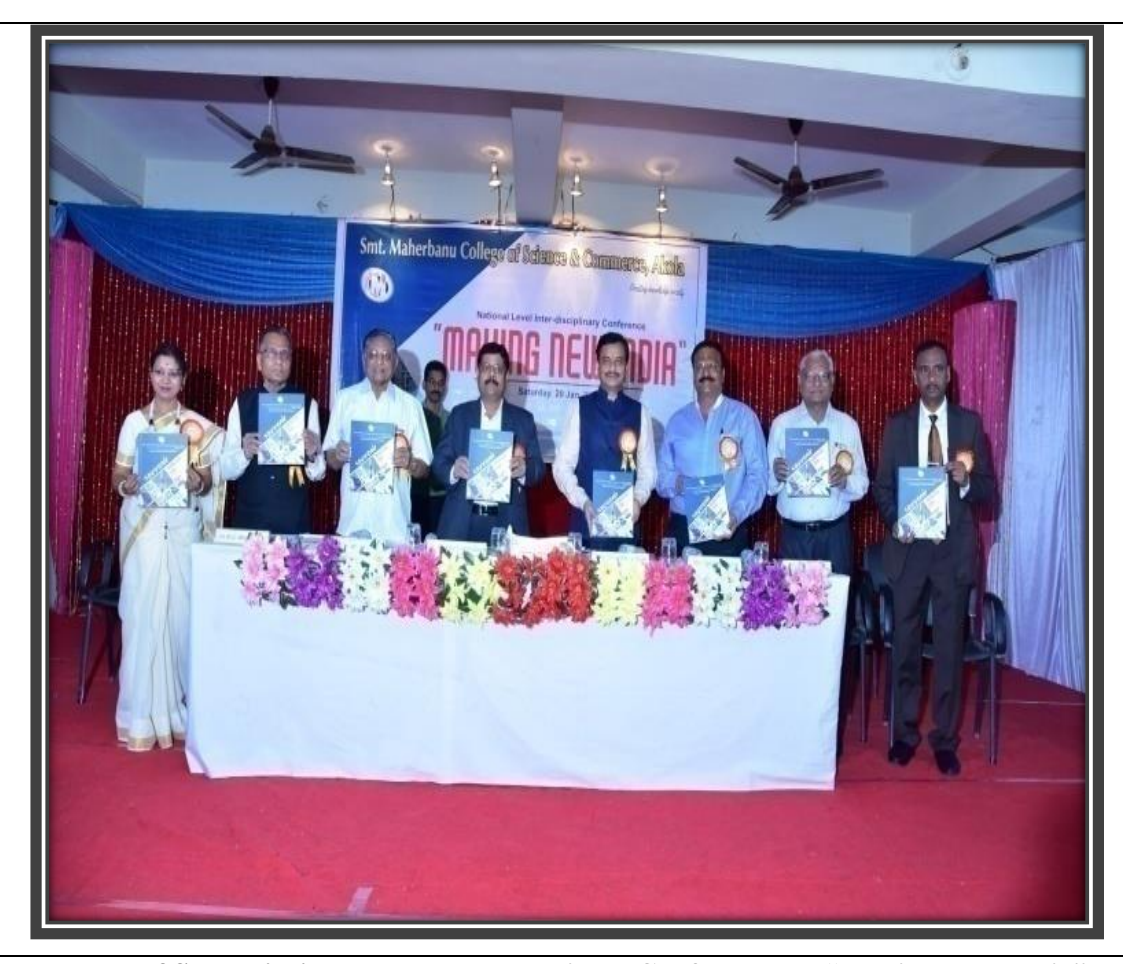
Release of Souvenir in Maher Varsha; National Conference on "Making New India".