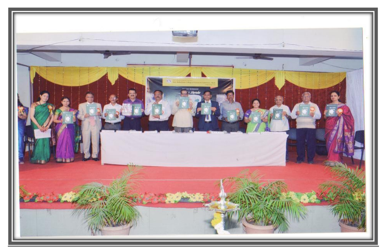
Release of Magazine "Maher Parwaz"